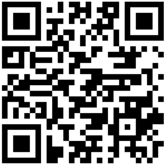
Figure 1: Public QR code for the excursion.

After downloading the app, one of the two QR codes below can be scanned for direct access to the excursion. Please be aware that only students are allowed to use the internal QR code. If you are visiting the excursion as an external person, please scan the public QR code.