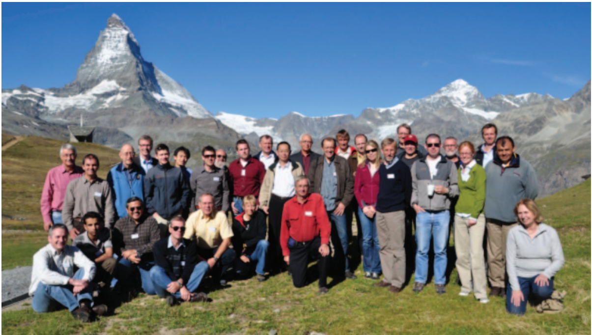
Figure 2. Participants of the WGMS General Assembly of the National Correspondents at Riffelberg in Zermatt, Switzerland, on September 3, 2010.

address on the historical background of international glacier monitoring and the integration of in situ measurements within the GTN-G strategy. Subsequent to the talk, national correspondents (or their deputies) gave overviews on the status and challenges of glacier monitoring in their respective countries.