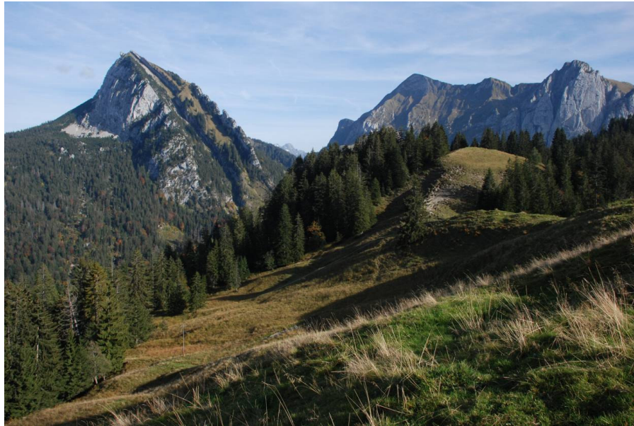
Figure 1. A view of Swiss Alps, Chöpfenberg in the background on the left.

The method selects salient mountains exclusively by analysing the horizon line (Figure 2). Further optimization is possible by considering only toponyms from topographical maps of a certain scale (e.g. 1:100 000 vs. 1:25 000,) to avoid selection of subsidiary summits. Such a selection allows for de-facto cartographic generalisation in salience estimation. People are likely to consider further aspects - specific shape of mountain silhouette, texture, geological and cultural significance to name a few - when selecting mountains for annotation of images. These considerations are subject to future research.