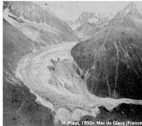
H. Plaut, 1850s: Mer de Glace (France)