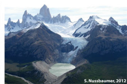
S. Nussbaumer, 2011