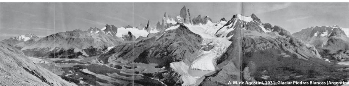
Glaciar Piedras Blancas (Argentina)