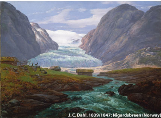
J. C. Dahl, 1839/1847: Nigardsbreen (Norway)