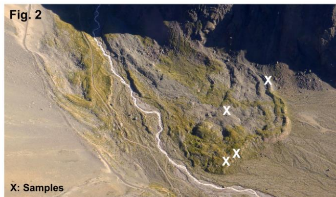
Figure 2: (see inset in Figure 1) Aerial photograph showing the outer frontal moraine complex preserved at Loma Larga Glacier.